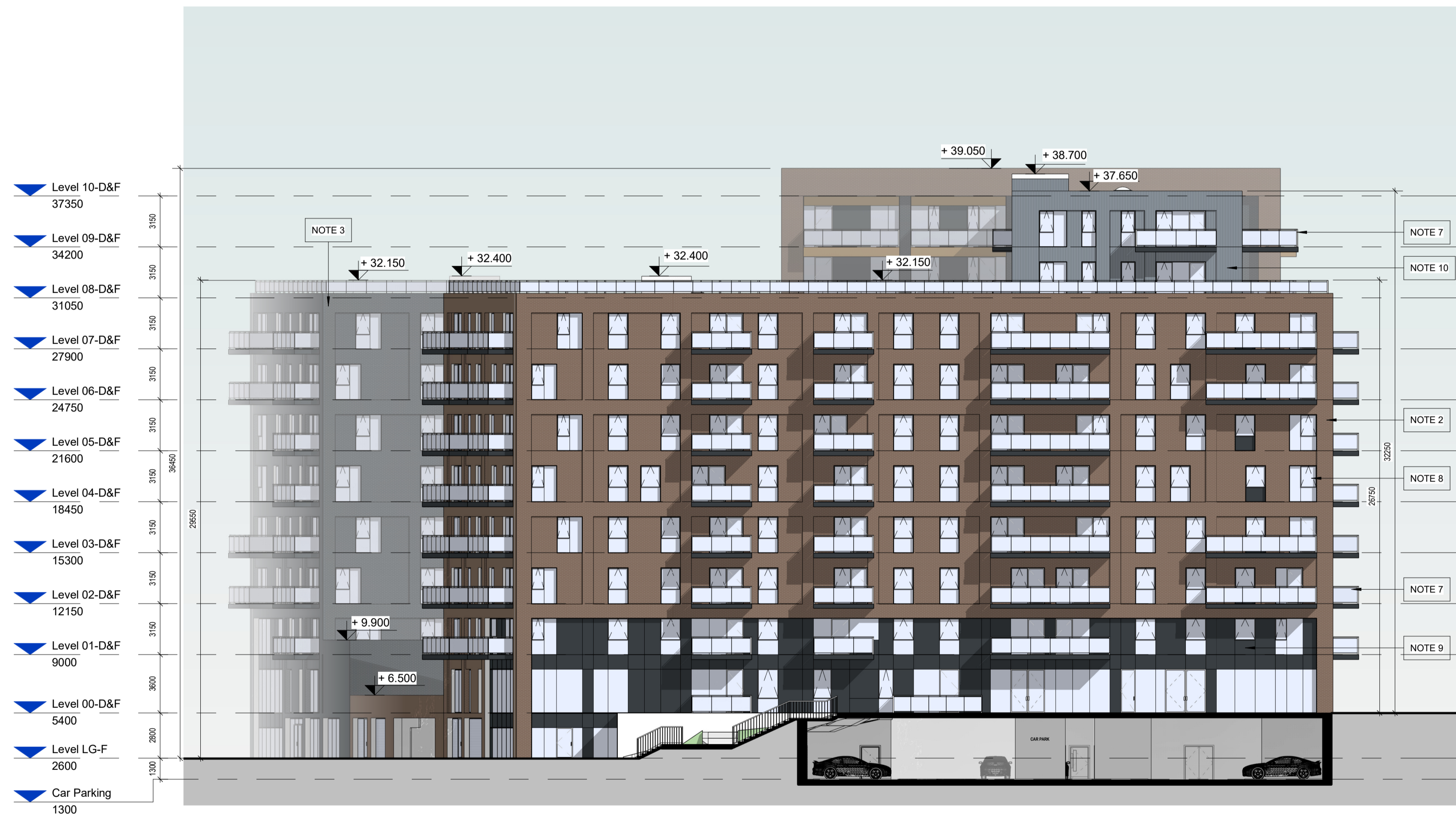
1 BLOCK F-EAST ELEVATION 1 : 200